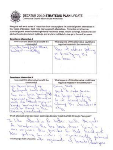
Worksheets at both Open Houses and the storefront space allowed citizens to give detailed input on each Conceptual Growth Plan