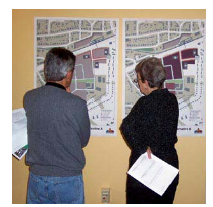
Citizens review the draft conceptual plans at an Open House