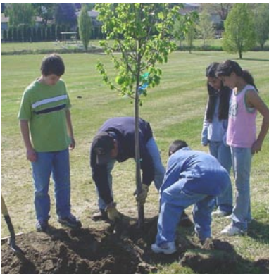
Mini-grants could fund neighborhood tree plantings and similar efforts

Task 6C Create a Decatur smart phone application to serve as a visitor and resident guide for local businesses, as well as a source of event and other information.