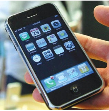
A Decatur smart phone application could benefit both residents and visitors