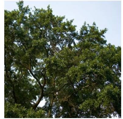
An urban forest plan could provide comprehensive guidance for the protection and expansion of Decatur’s tree canopy