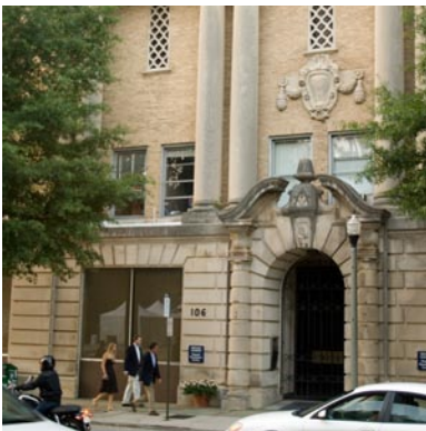
The protection of existing historic buildings is essential to preserving Decatur's identity

Please see the Concept Plans for examples of how new development in these areas could occur.