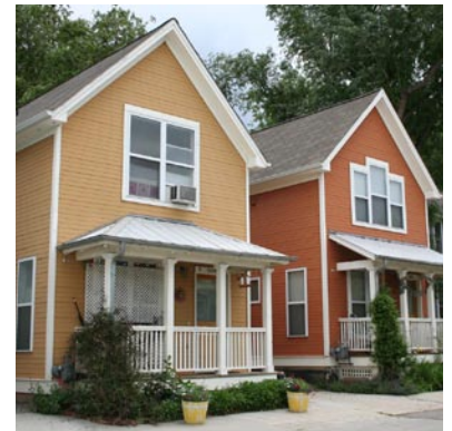
Small cottage homes can expand the range of housing prices provided in Decatur, but are currently illegal

Task 16H Expand car-free day activities to increase efforts to promote physical activity and walking.