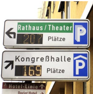
Electronic signs can show parking availability upon entering the downtown area

Task 14I Promote more efficient use of parking with electronic signs, shared use of existing lots and decks, consolidated parking meters, more strict enforcement, higher parking fines, and similar techniques.