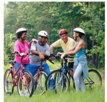
People of all ages can benefit from programs that encourage physical activity