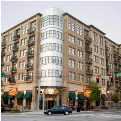
The last decade saw a major increase in Downtown housing