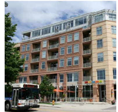
Redevelopment opportunities can help expand the property tax base