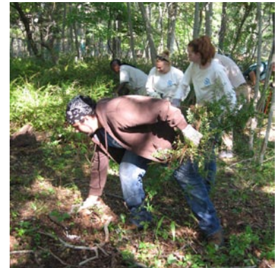
Invasive plant removal can start to restore native ecosystems, while strengthening community bonds