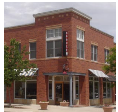
Commercial design standards will ensure more compatible buildings