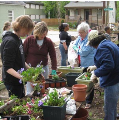
Community gardens bring people together and strengthen community bonds