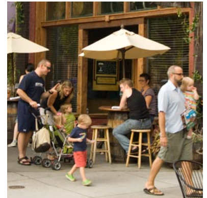
The walkability and human scale of Decatur must be preserved

Upgrades could include pedestrian facilities, street furniture, trees, public spaces, or interactive kiosks with maps, visitor information, event schedules, and community information.