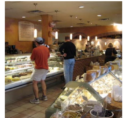
Increased retail sales can provide additional tax revenues for the city