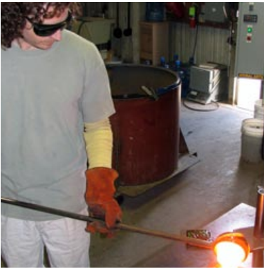
Artisanal manufacturing could expand the market for locally-produced goods

Task 1E Improve the landscaping and physical appearance of the Square.