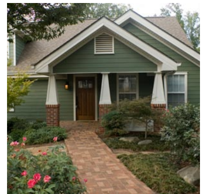
Decatur should strive to be a place that is accessible and visitable for people with disabilities