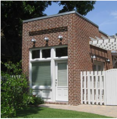
Some communities have amended their zoning to permit small home businesses on single-family lots