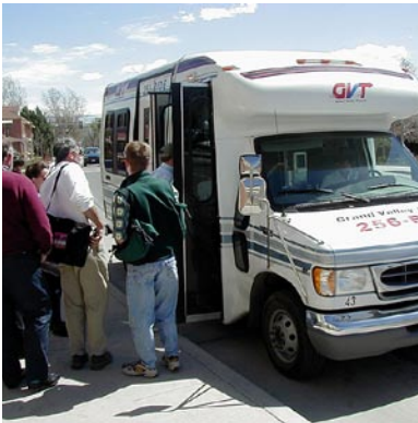
A local shuttle service is a priority for Decatur residents

Decatur must be an active community that supports healthy living at all points in a person’s life. This means creating an environment that supports physical activity for people of all abilities and ages, providing housing and services for all citizens, and nurturing programs that reinforce these concepts, especially for under-served populations.