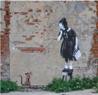
The arts enhance a quality of life and community identity