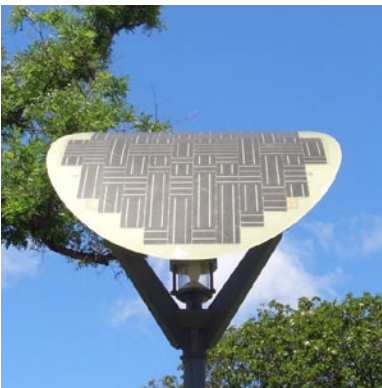
Solar street lights can reduce energy consumption

Task 11C Convene an annual forum for non-profit, public, religious, and institutional organizations to share ideas, resources, and strategies to meet the strategic goals of the community.