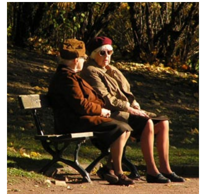
Naturally occurring retirement communities allow people to grow old around friends and family, in a familiar environment