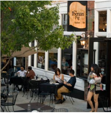
Restaurants have been pivotal in Decatur's commercial renaissance