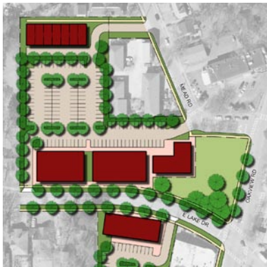
The Concept Plans on page x show examples of how long-term development might occur